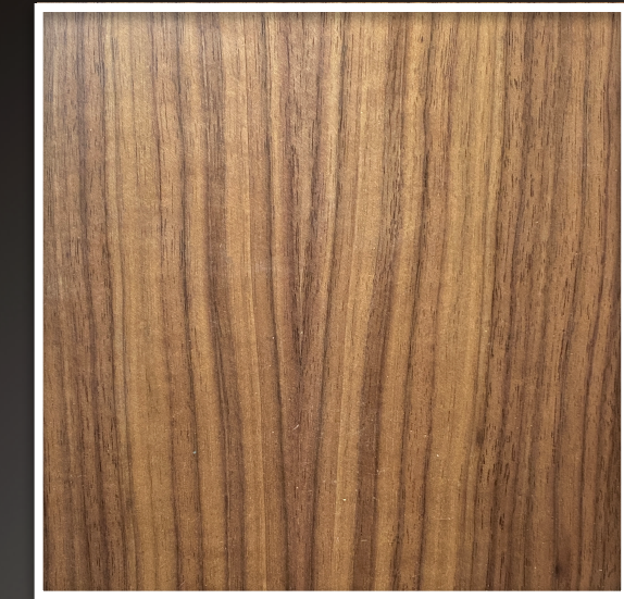
American Walnut - Reconstituted